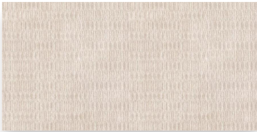
24" x 48" Field