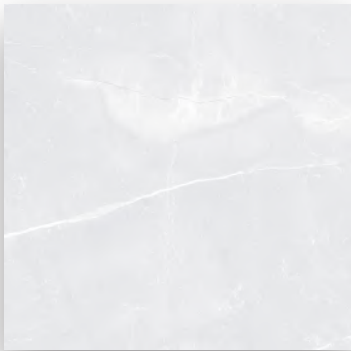
36" x 36" Field