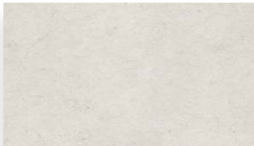
24" x 48" Field