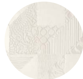
White Nur Relief