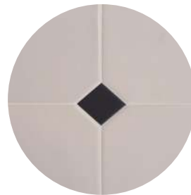
White with Black