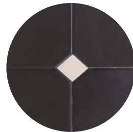
Black with White