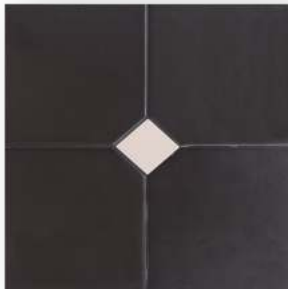
8" x 8" Octagon