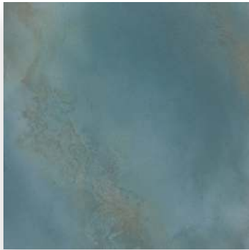
36" x 36" Field