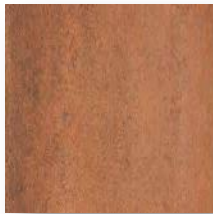
12" x 12" Tread