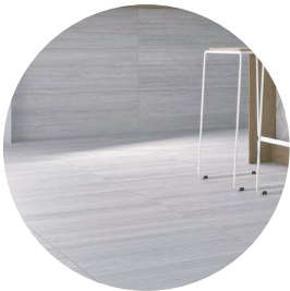
Floor Tile (24" x 24" Only)