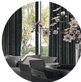
Exterior (24" x 24" Only)