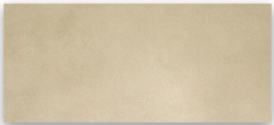
12" x 24"