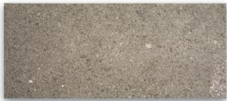
24" x 48" 2cm Paver